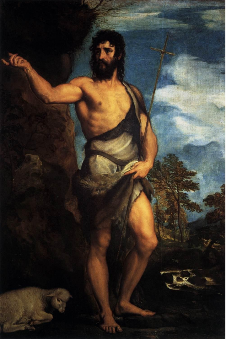
Saint John the Baptist a portrait by Titian, c 1540