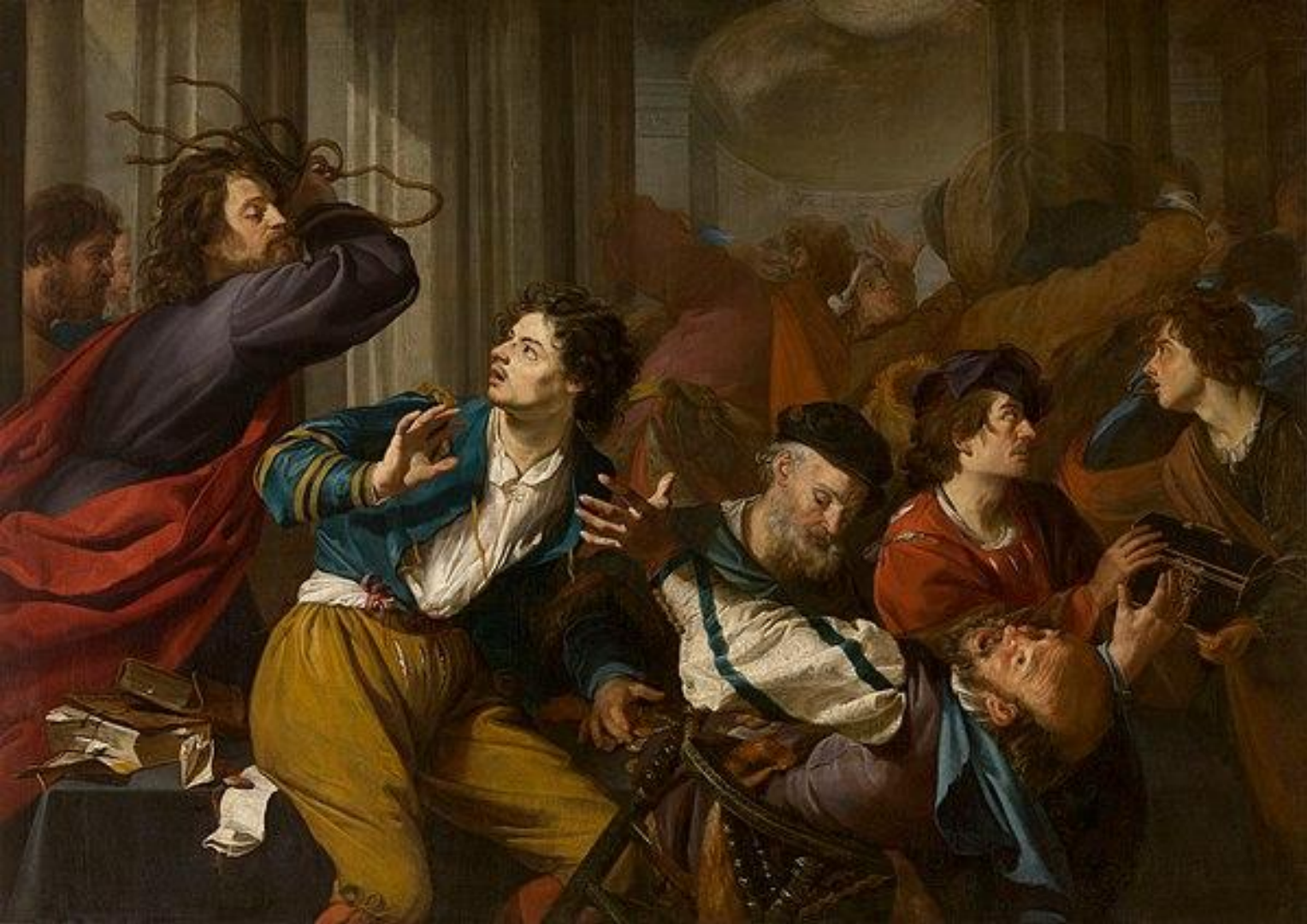
Christ Driving the Money changers from the Temple by Theodoor Rombouts , 1637