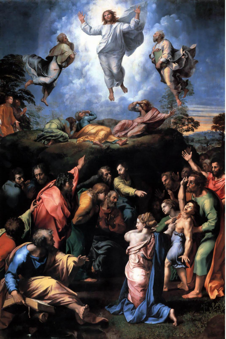
The Transfiguration Raphael (1510-16)